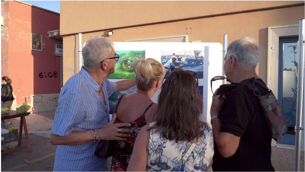
"The Sea of Anzio" curated by the CO>SEA research group (Sapienza University of Rome + Raw-News Visual Production Agency).